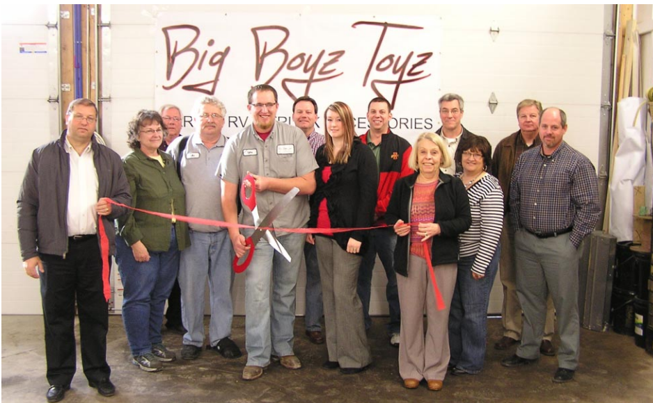
On March 15 th the Creston Chamber of Commerce Ambassadors held a Ribbon Cutting at Big Boyz Toys, 900 S. Division.