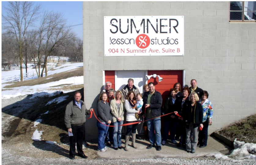
The Creston Chamber of Commerce Ambassadors held a Ribbon Cutting at Sumner Lesson Studios, 904 N. Sumner, Suite B on March 8 th .