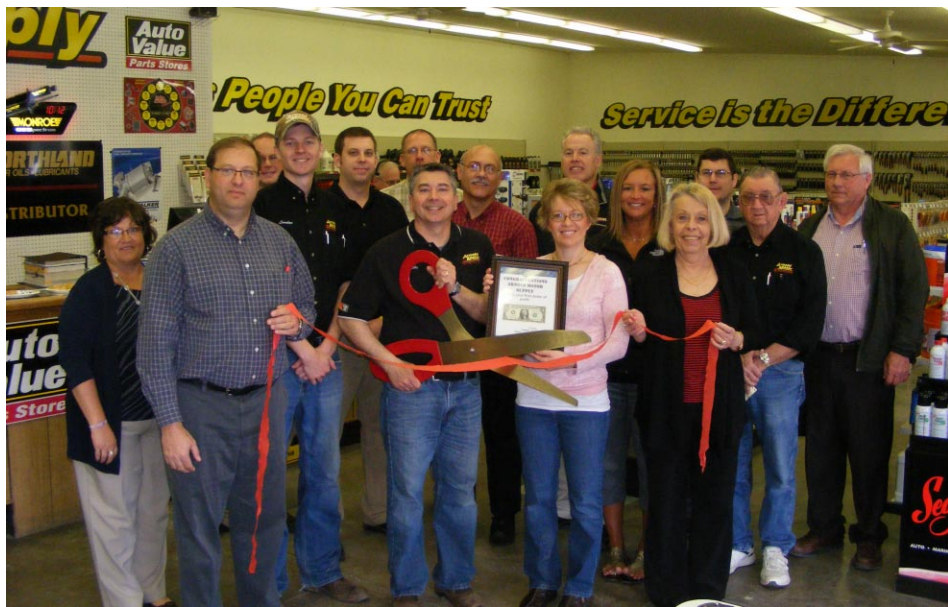
On April 9 th the Creston Chamber of Commerce Ambassadors held a Ribbon Cutting at Arnold Motor Supply, 502 West Adams.